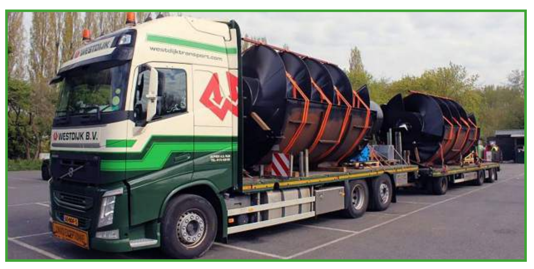
The turbines arriving from The Netherlands

facebook.com/rdghydro 💟 @rdghydro 🎯 @rdghydro www.readinghydro.org