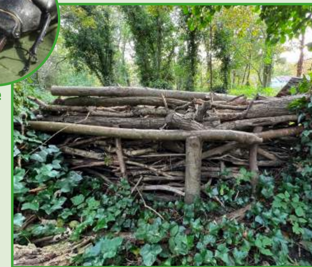
An insect home